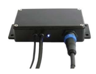
BLK-BOX<sup>†</sup> Black Box data converter outputs analogue and SDI-12 serial data for stand-alone AquaPlus™ and Aquaprobe™ use