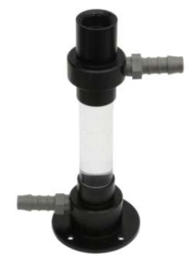
DO-Flow Heavy duty Flow-Through cell

*AquaPlus™ Probes are supplied as standard with a 3m cable and are limited to 10m immersion depth by the integrity of the connector. Custom cable lengths can be fitted at the time of ordering to eliminate extension cables and in-line connectors thereby allowing use down to 30 \, \text{m} depth .