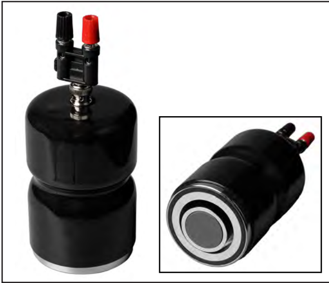
Figure 7. Charleswater 99028 Concentric Ring Probe

The Charleswater 99028 Concentric Ring Probe is an instrument to be used in conjunction with a resistance meter, such as the Charleswater 99027 Digital Surface Resistance Meter, to measure surface resistance per EN 61340-5-1 Table 4 Packaging of solid planar materials.