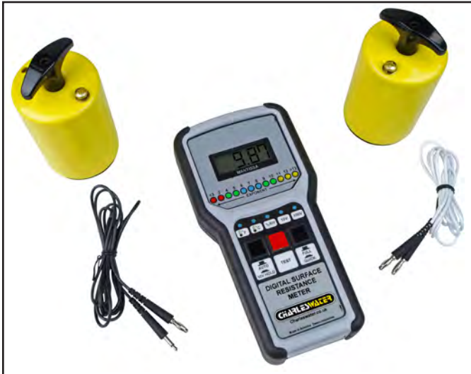
Figure 1. Charleswater Digital Surface Resistance Meter Kit