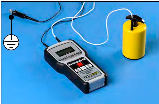
Figure 5. Rg test setup

If the measurement is outside acceptable limits, clean the surface with an ESD cleaner containing no insulative silicone such as Rezfore™ Antistatic Surface & Mat Cleaner , and re-test to determine if the cause of failure is an insulative dirt layer or the ESD worksurface material.