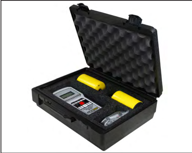
Figure 2. Charleswater 99026 Digital Surface Resistance Meter Kit