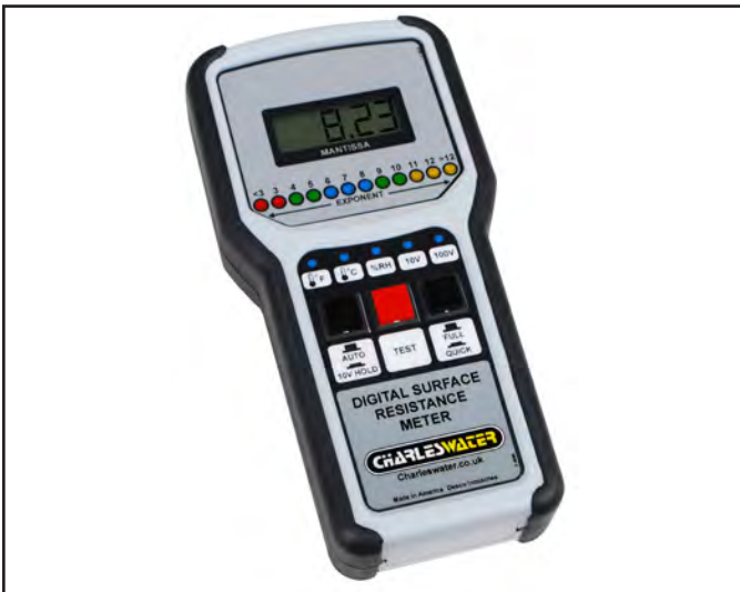
Figure 3. Charleswater 99027 Digital Surface Resistance Meter