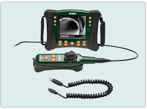
HDV640W VideoScope, wireless handset & 6mm diameter semi-rigid articulated (240°) probe