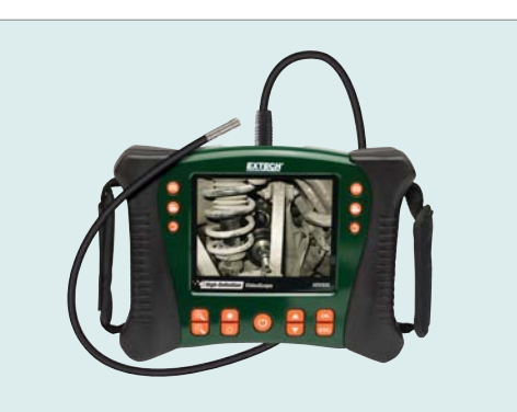
HDV620 VideoScope with 5.8mm diameter semi-rigid probe (1m length)