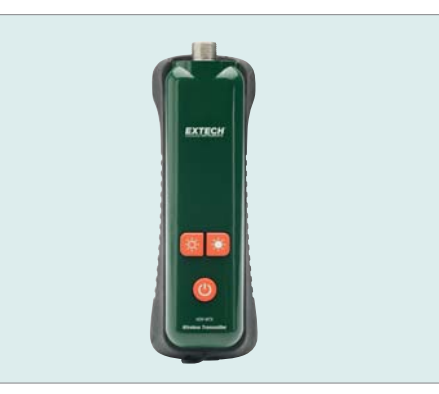
HDV-WTX Universal wireless handset, accepts several scopes of varying diameters, lengths, and flexibility