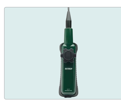
HDV-TX1, HDV-TX2 Wired handset with 6mm diameter semi-rigid articulated (240°) probe (1m, 2m versions)