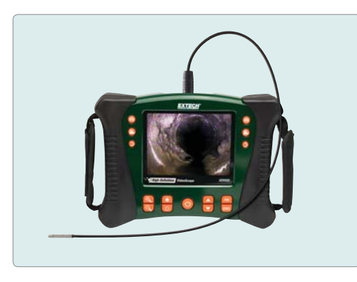
HDV610 VideoScope with 5.5mm diameter flexible probe (1m length)