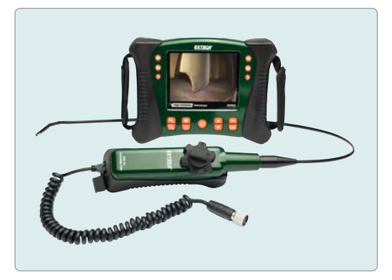
HDV640 VideoScope, wired handset & 6mm diameter semi-rigid articulated (240°) probe