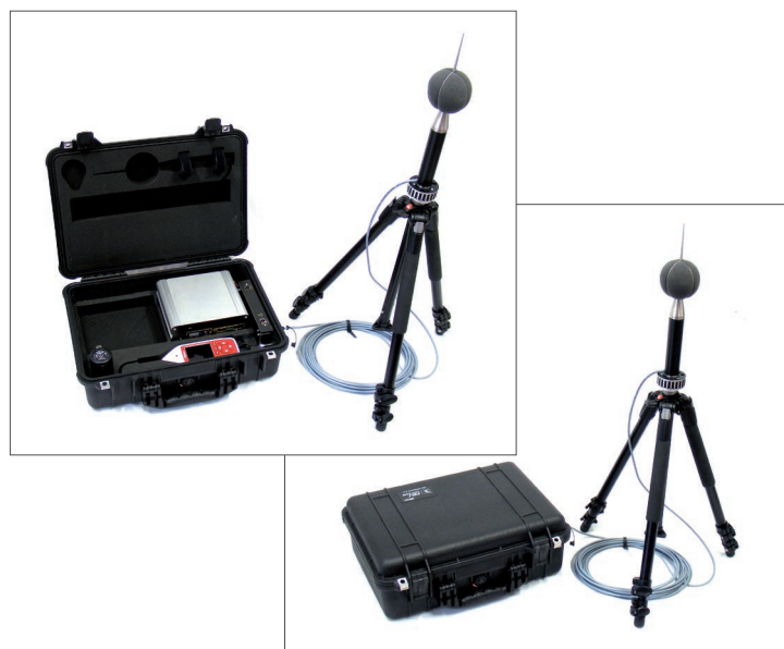
CK:670 outdoor kit shown with optional CT:7 tripod

NoiseTools will display verification symbols if the information matches: a unique feature that will prove very useful should you ever become involved in legal proceedings regarding your noise measurement data.