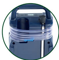
Mast and sampling tube are fitted to the pump, during use and transportation

The Vortex3 is an ideal device to be used by personnel carrying out sampling surveys trained to RP402 level by BOHS.