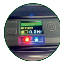
OLED full colour display with Red/ Blue LED's to indicate pump status, visible from a distance