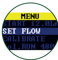
Intuitive menu navigation