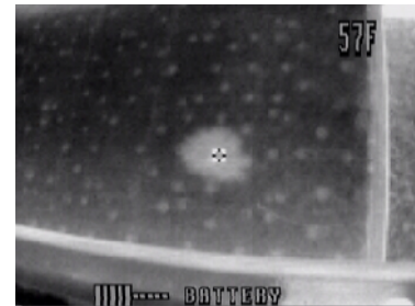
Roof leak w/temp